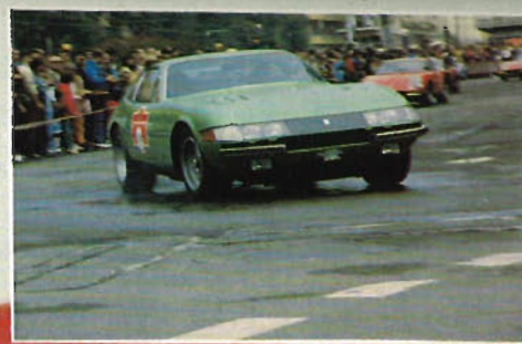
Main picture, beautiful bonnets — two 250 TDFs side by side. Above, 250MM Vignale at Imola and above centre, a 250GTE export again at Imola. Above right, Clay Regazzoni at the wheel of his manual-control Daytona 365 GTB/4

European model production commencing in March 1984. The planned production target for the model is 100 USA-specification cars, and 100 other market cars per year.